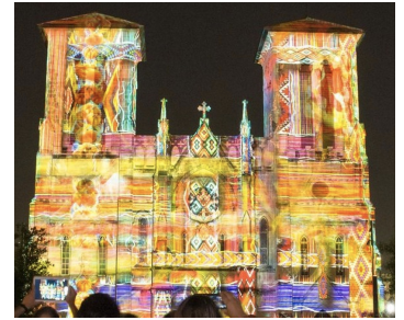
The Saga – San Antonio

This unique video art projection depicts the historical discovery, settlement and development of San Antonio, the Lone Star State, and United States history. The Saga projection covers 7,000 square feet of light, color and visual narration projected onto the majestic façade of San Fernando Cathedral, the oldest cathedral in the United States. Food trucks are normally available each night.