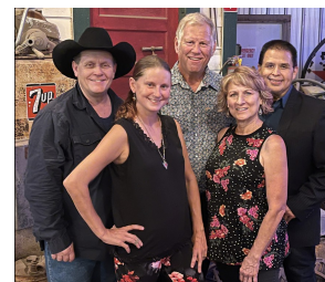
Cactus Country from 8-11pm.

Suggested attire for the evening is Texas Casual - Denim & Diamonds, Leather & Lace, Boots & Belt Buckles, Cowboy Hats & Sombreros. Anything goes!! Come have some fun - it will be a great time for all.