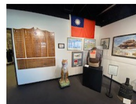
The "500 Club" Board

It was established to provide funds for the preservation and display of the Clubs' extensive collection of historical material, documents, photos and other memorabilia. A donation of $500, or more, provides a permanent plaque on the Board of Recognition. The plaque may be requested by a former Tiger in his or her name to support the Museum; or by family or friends in recognition or remembrance of their dedication to Flying Tigers.