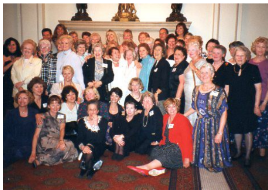
San Antonio 1999 First Flight Attendant Recognition Reunion

Being bored, like many of you, I've been staying home and catching up on projects that have long eluded me. One of them has been going through boxes of pictures from times of the past.