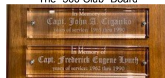
Recognition for Ciganko and Lynch