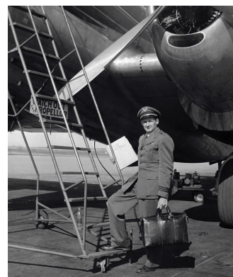
Boarding an FTL Connie