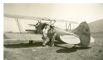
Libra in basic flight training