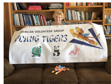
The small Flying Tiger toy is brand new and will be available for sale at the AVG reunion in addition to our own Hangar store at San Antonio

If you are interested, please email me ( avgeditor2016@gmail.com ) and I can send you all the information and registration forms. Or call me at 760-453-1233.