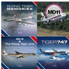
The Airline Boutique