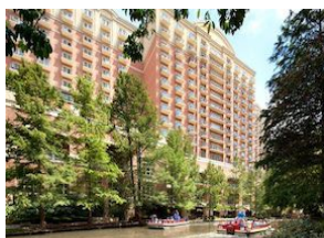
The Westin Riverwalk San Antonio, TX