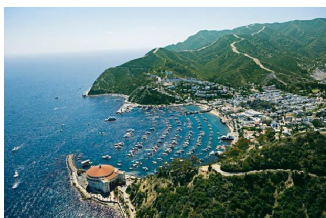
Avalon Bay – Catalina Island

The following have sent in their payments for this fun post-reunion excursion. For more details visit the Catalina Adventure page on this site.