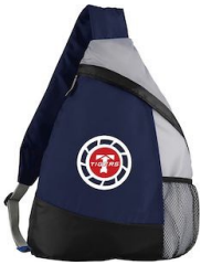
Cycling Sling Bag Included

After our ride we will be meeting for brunch on the patio at The Yardhouse in the same Shoreline Village. The following have indicated a desire to join the group ride.