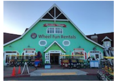
Wheel Fun Rentals Shoreline Village

I will be mailing a letter to all who indicated that they were interested in the Group Bike Ride on their registration forms (see below). My mailing will include a map of the route and procedures for sending in your fees for this group event. Click on the link at right for more information about our rental company and to explore the equipment that is available.