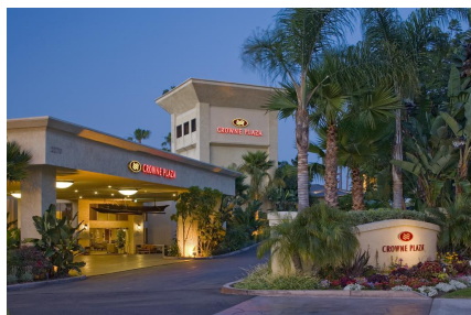
Crowne Plaza Hotel San Diego, CA

For those that have the available time, we hope to plan a post-reunion excursion for the 4-hour bus trip up to Fredericksburg, TX for a multi-day visit to experience the National Museum of the Pacific War, wineries, breweries, and other attractions that this charming little city has to offer. More details will be available next year. Note: the reunion will take place from Sunday to Tuesday as opposed to traditional weekend days.