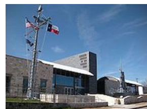
National Museum of the Pacific War Fredericksburg, TX

May 2 nd to May 5 th , 2020 Group Rate of $189 per night