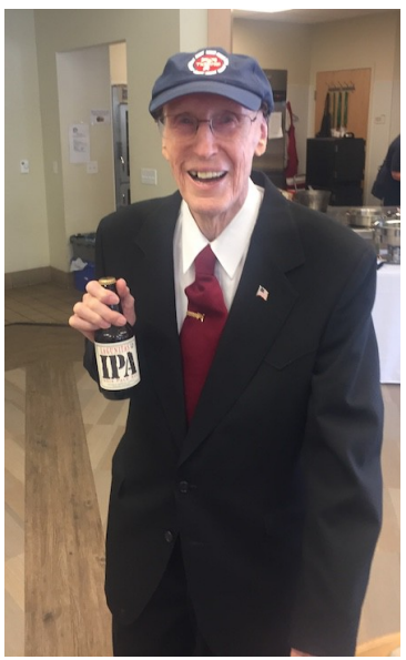
Once a Tiger, Always a Tiger!