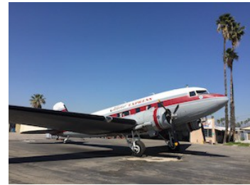
The Flabob Express