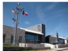
National Museum of the Pacific War Fredericksburg, TX

2020 San Antonio, TX Location & Date to be announced soon. Reunion will include a trip to the National Museum of the Pacific War on Friday.