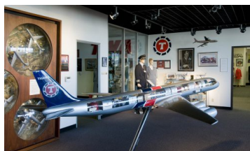
Flying Tiger Line room in the Flight Path Museum