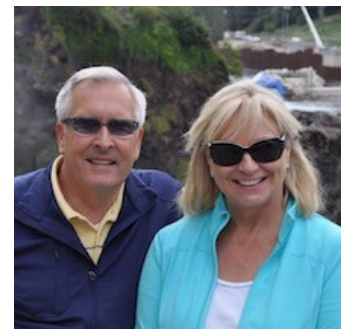
The Royal Couple, Lord and Lady Wake