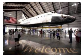
OV-105 Endeavour at the California Science Center

2019 45-Year Anniversary Reunion Renaissance Long Beach Hotel 111 East Ocean Boulevard Long Beach, CA 90802 May 1 st to May 5 th , 2019 Visits to Flight Path Museum at LAX and California Science Center in L.A. Lunch at the new Proud Bird Restaurant