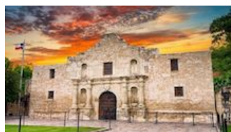
The Alamo at sunset

2020 San Antonio, TX Location & Date to be announced soon. Reunion will include a trip to the National Museum of the Pacific War on Friday.