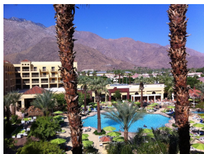
Renaissance Hotel – Palm Springs