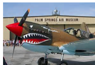
P40 at the Palm Springs Air Museum

Friday night at the Palm Springs Air Museum