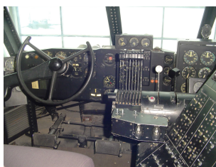
We're hoping to get everyone into the Spruce Goose cockpit for a photo opportunity.