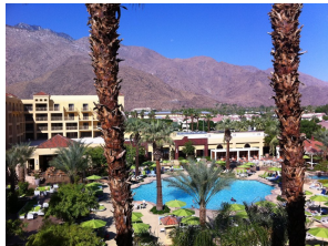
Renaissance Hotel -- Palm Springs

2018 Flight Attendant Recognition Banquet Renaissance Palm Springs Hotel 888 E Tahquitz Canyon Way Palm Springs, CA 92262 May 2 nd to May 6 th , 2018 Friday night at the Palm Springs Air Museum