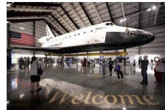
OV-105 Endeavour at the California Science Center

2019 45-Year Anniversary Reunion Renaissance Long Beach Hotel 111 East Ocean Boulevard Long Beach, CA 90802 May 1 st to May 5 th , 2019 Visits to Flight Path Museum at LAX and California Science Center in L.A.