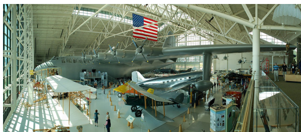
The Hughes H-4 Hercules

We have added additional buses for a maximum capacity now of 201 passengers. As of this date we have 165 attendees that have made their payments for the event.