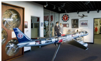
Flying Tiger Line room in the Flight Path Museum

2019 45-Year Anniversary Reunion Renaissance Long Beach Hotel 111 East Ocean Boulevard Long Beach, CA 90802 May 1 st to May 5 th , 2019 Visits to Flight Path Museum at LAX and California Science Center in L.A.