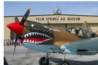
P40 at the Palm Springs Air Museum

FTLPA donated $2500 to the PSAM last year. To view letter of gratitude Click Here