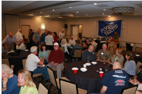
Hospitality Suite on Friday Night

Except for a little rain on Friday, the weather was perfect throughout our weekend together, and the mood was just right for everyone to spread out on day tours and enjoy all that the wine country had to offer us. Hotel renovation and relocation issues disappeared thanks to the magic that is Napa, California.